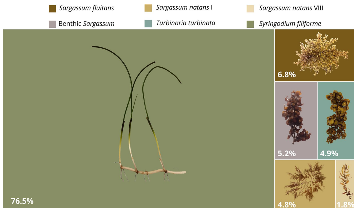
Fig. 1 Proportion of the different marine macrophytes found in the beach-cast biomass collected at Puerto Morelos, Quintana Roo, Mexico and their relative abundances

The beach-cast biomass collected in December 2018 at the Mexican Caribbean coast included both holopelagic (floating) and benthic (bottom-attached) brown seaweeds, and a benthic seagrass (Fig. 1). The seagrass Syringodium filiforme Kützting showed the highest relative abundance ( 76.5 \pm 9.0\% ) of the beach-cast biomass, followed by the holopelagic species of Sargassum ( \sim 13.4\% ), while other benthic brown seaweeds including Turbinaria turbinata (Linnaeus) Kuntz ( 4.9 \pm 8.3\% ), as well as a small amount of benthic Sargassum ( 5.2 \pm 6.3\% ) composed of a variety of species. Although some previous studies have reported the